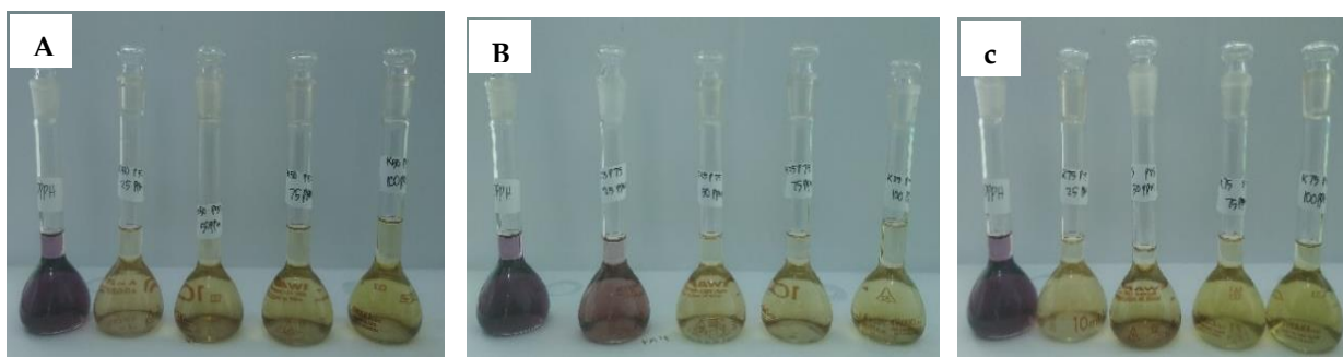
Figure 3. Antioxidant activity of Tetragonula testaceitarsis propolis (P) extract combined with Lepisanthes amoena leaves (K). Combination comparison was showed on (A) P 75% : K 25 %; (B) P50% : K50%; (C) P25%: K75%.

There are five grades of antioxidant activity such as very strong, strong, moderate, weak, and very weak (Lung & Destiani, 2018). This combination is expected to have antioxidants with an IC 50 prospect of less than 50 ppm which is classified as a very strong category (Djaeni et al., 2017; Purwanto et al., 2017; Safrudin & Nurfitasari, 2018). Antioxidant activity is influenced by several factors. The source of Tetragonula testaceitarsis propolis is the sap of certain trees, including the damar tree. The active compounds in the collected tree sap also play a role in the synergistic effect of the combination. The Lepisanthes amoena also has dominant secondary metabolites such as phenolic compounds, flavonoids, glycosides, terpenes, and tannins (Zulkifli et al., 2021).