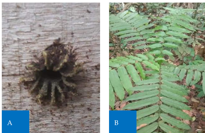
Figure 1. (A) Characteristics of the nest entrance of Tetragonula testaceitarsis and (B) Lepisanthes amoena leaves

and Kutai Kartanegara on June 2022 (Figure 1). Ethanol, Methanol, DPPH, Aquadest was used in extraction and antioxidant determination. The equipment used in this study is analytical balance sheet ( Ohaus ), Vortex ( Thermo ), Aluminum foil, UV-Vis Spectrophotometer, Micropipette.